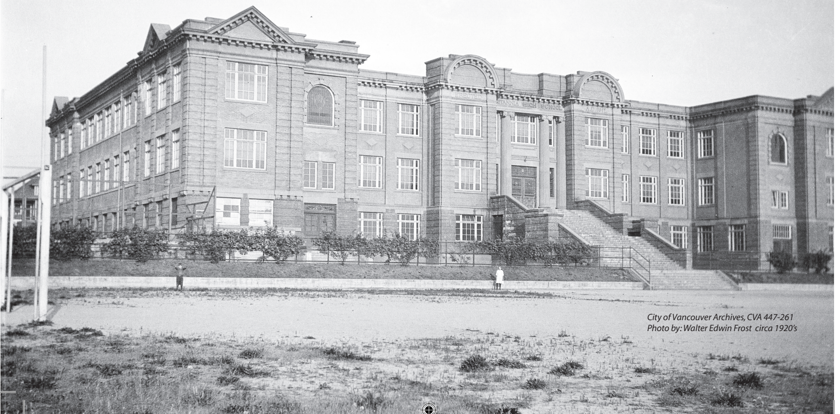
City of Vancouver Archives, CVA 447-261 Photo by: Walter Edwin Frost circa 1920's

The history behind the Britannia Community Education Center is a story of neighbourhood action in response to a government proposal to build a freeway through the current property. Dedicated and committed groups and individuals convinced the City to create a true community center on the Britannia site, that would serve every member of the neighbourhood and they did just that. The Vancouver School, Parks and Library Boards all cooperated, (and still do) creating something very special and unique. Their continuing cooperation and grassroots response to this community's needs have made this 18 acre complex an exciting, vibrant and progressive community complex.