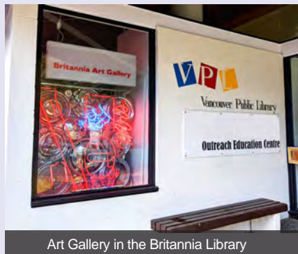
Art Gallery in the Britannia Library