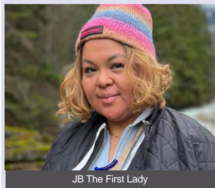
JB The First Lady

Sun 12:00-4:00pm Feb 2, 9, 16, 23 Conference Room