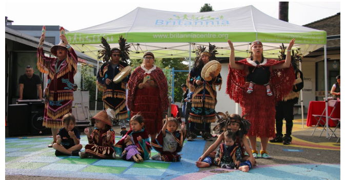
Photo: Coastal Wolf Pack dance group from the xʷməθkʷəy̍əm (Musqueam) nation performing at Britannia's 2019 Reconciliation in Action event.