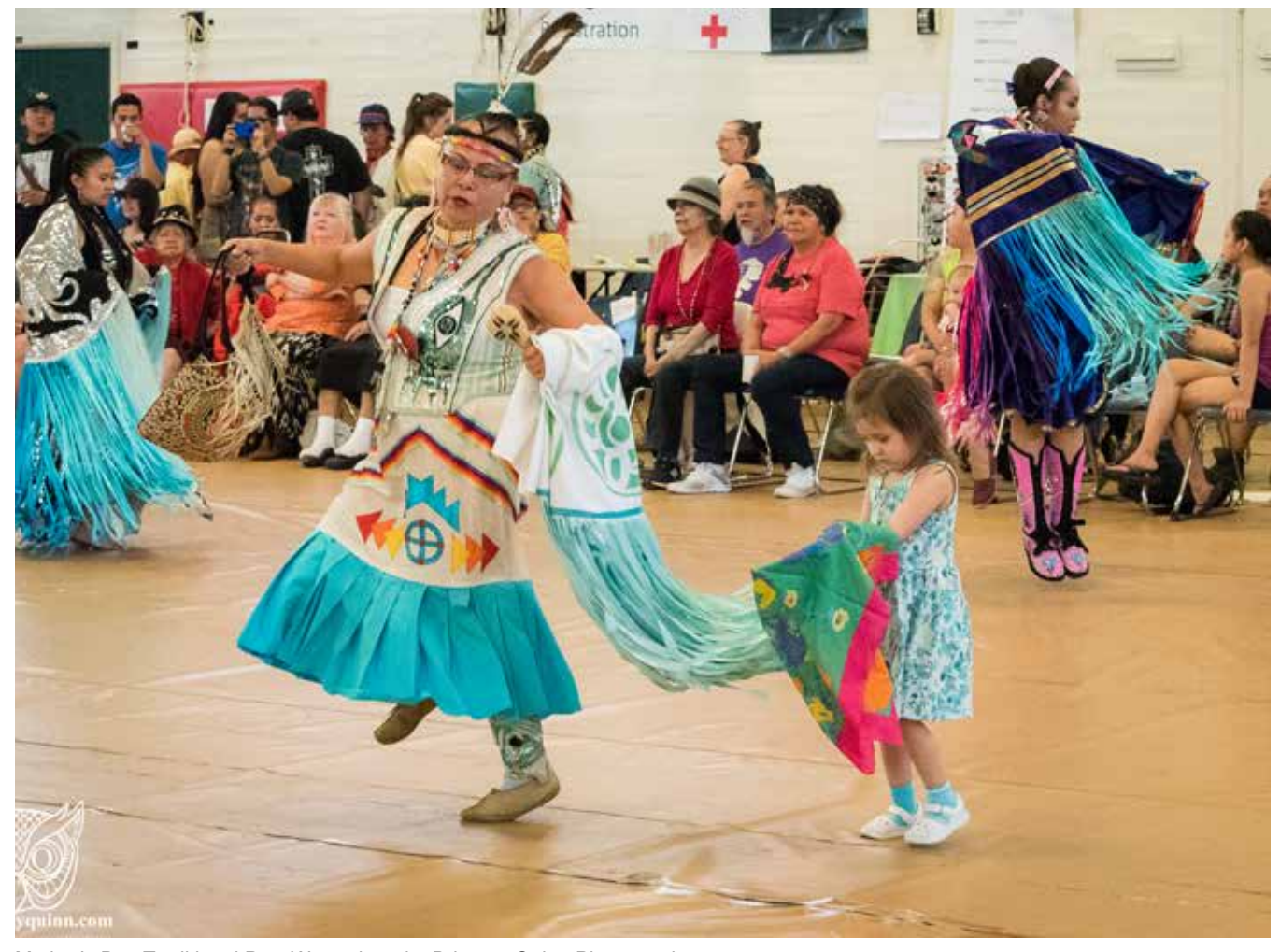
Mother's Day Traditional Pow Wow, photo by Britanny Quinn Photography