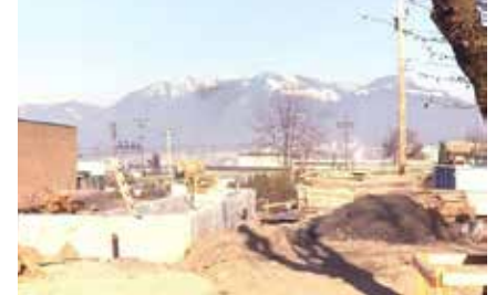
Britannia under construction, early 1970s.

In the 1970's when the Britannia model was developed the Britannia Community Services Society ('the Society') represented the cutting edge in community service design—even the unique layout of the site followed the emerging "pattern language" style of architectural organization. The joint operating structure was also ground-breaking and entirely unprecedented in Vancouver. The site has operated under a partnership between the Britannia Community Services Society, the Vancouver Parks Board, the Vancouver School Board,