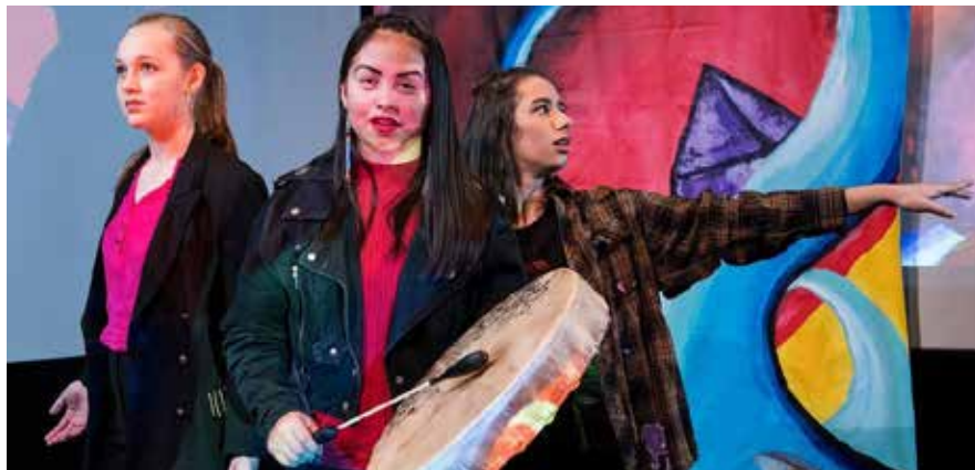
Vancouver Youth Week 2018.

Youth Week is an internationally celebrated event to promote awareness of youth, increase positive public profile of youth and build stronger connections between youth and the community. During Youth Week, young people around the world organize and participate in events, performances, forums and community projects.