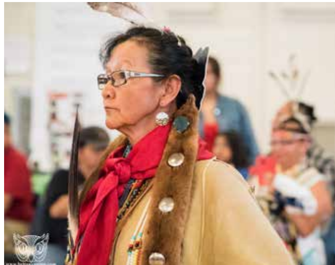
2018 Mother's Day Traditional Pow Wow