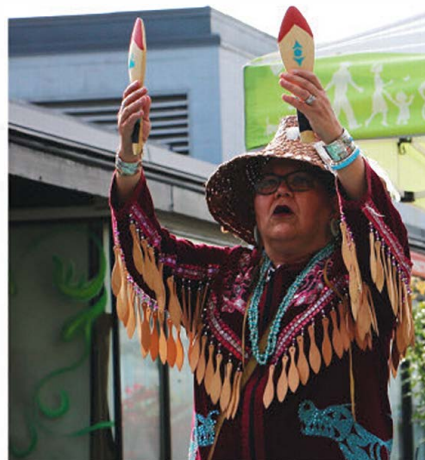
The Coastal Wolf Pack dance group from the Musqueam Nation at the 2019 RIA celebrations.