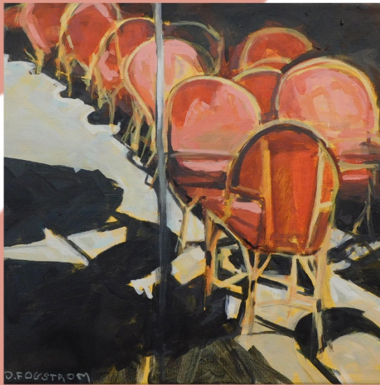
PARIS: LOVE AND PROTEST