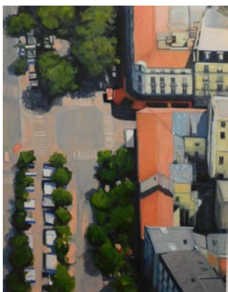
Paris Art Market