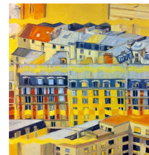
Cadmium Yellow Paris