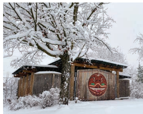
Winter snow blankets ʔxʷqʷeləwən ct