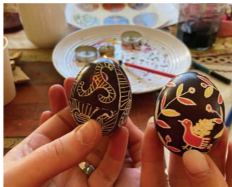
Traditional Easter Egg Pysanka