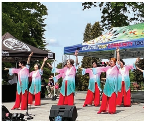
Chinese Folk Dance group perform at SHINE