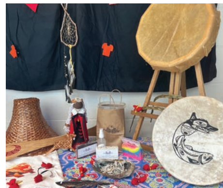
Indigenous Knowledge Keepers exhibit