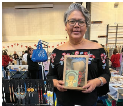
Winter Craft Market