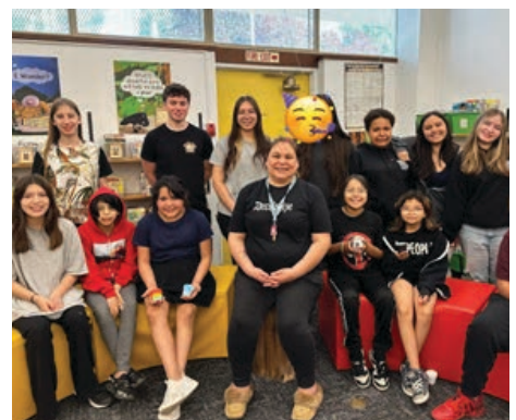
WCT at Grandview Elementary