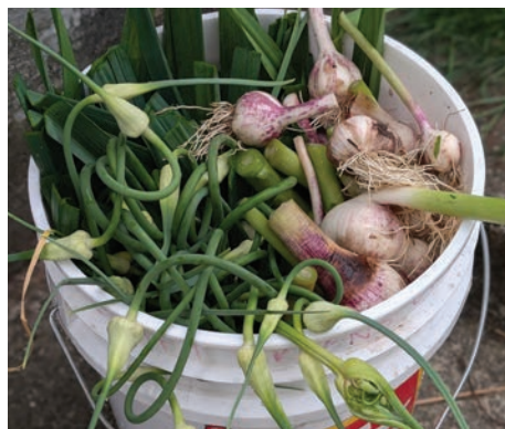
Div 11 harvest of garlic and scapes