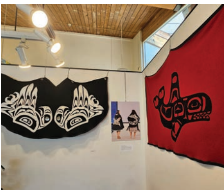
Girls Who Leap group art exhibit