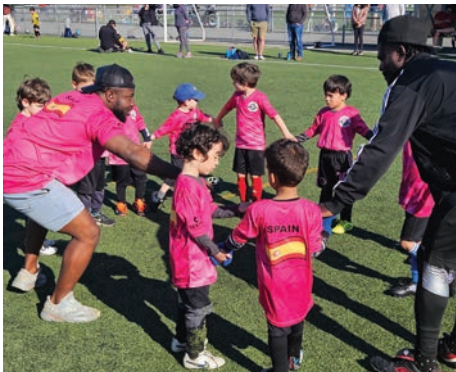
Game day for Micro Footie League