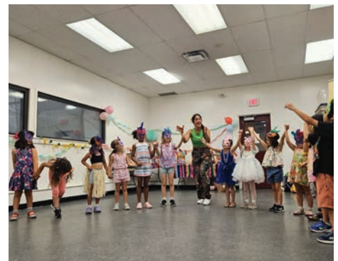
Latin Culture camp