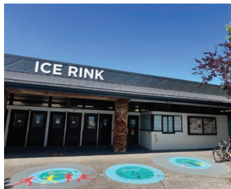
Britannia Ice Rink