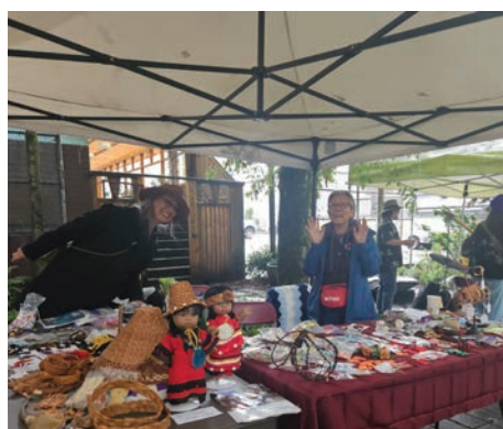
Craft Collective at a Fall Plaza Market