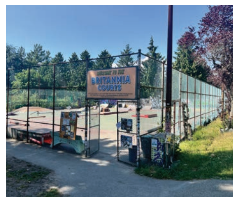
Britannia Courts Skate Park