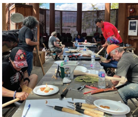
WCT Paddle Carving