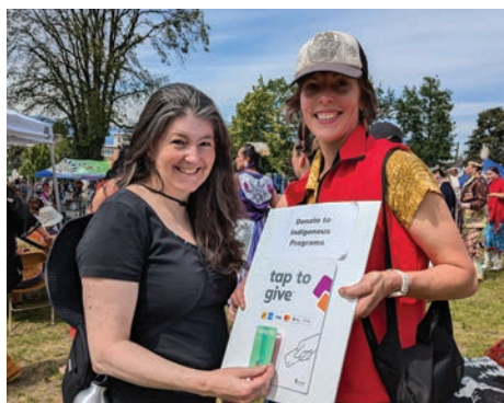
TipTap to donate!