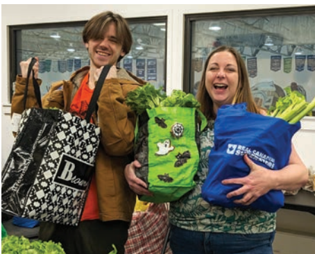
Britannia Bulk Buy Food Club

Community Recreation Coordinator on behalf of the Britannia Programming Team