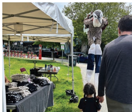
Bird encounter at SHINE