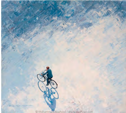
Acrylic by M. Atashzad