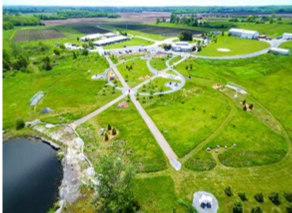
Oeno Sculpture Garden 2017

https://oenogallery.com/assets/Email-Assets/Sculpture-Garden-Map.pdf