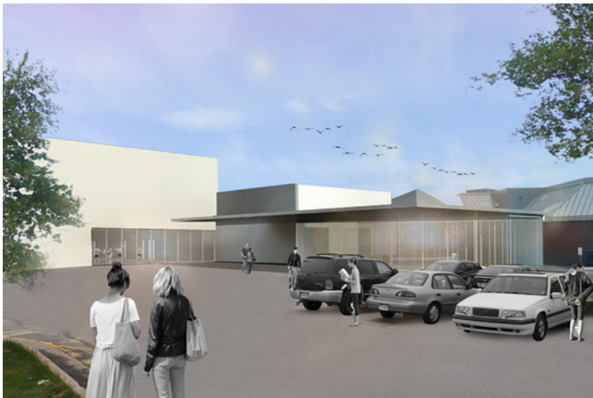
Dartmouth Sportsplex-East Entry