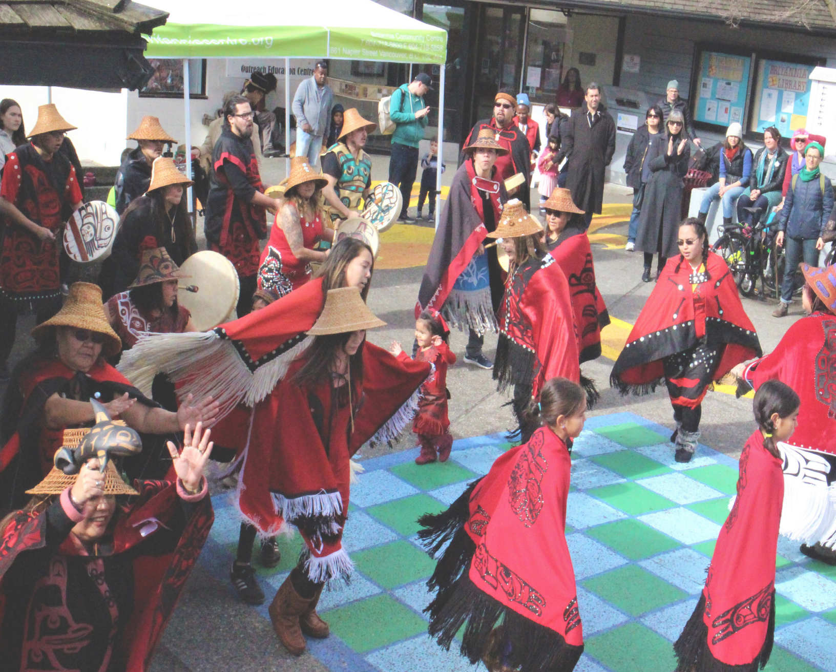
Lax K'ween Dancers at the B-Lab Open House