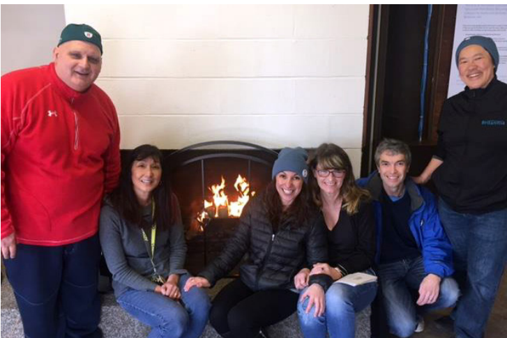
Celebrating the Launch of Britannia Renewal Britannia staff gather in front of the Info Centre fireplace at the Britannia Renewal Open House and Ideas Fest on March 4 2017.