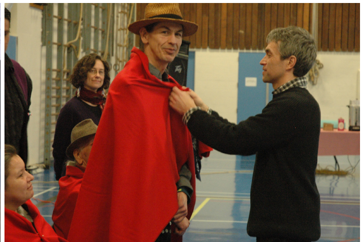
Honouring the Leaders in Our Community We recognized and acknowledged the contributions of outstanding community members with a Salish Honouring Ceremony in February.