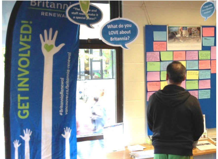
Community members are invited to participate in the Britannia Renewal process through interactive installations in the Information Centre "B-LAB"..

This engagement and consultation has informed how changes to the site may be made, and how the facilities of the future could look. The work of the board as a whole has been to participate in the many meetings held to further this discussion, to listen carefully to all the views expressed, and to give our consideration to the expansive information we have been provided with. Many meetings between the elected city boards and council, and the elected Britannia board, are being held for the purpose of ensuring that folks are informed of the work done here and the importance of moving forward with facilities renewal on the site.