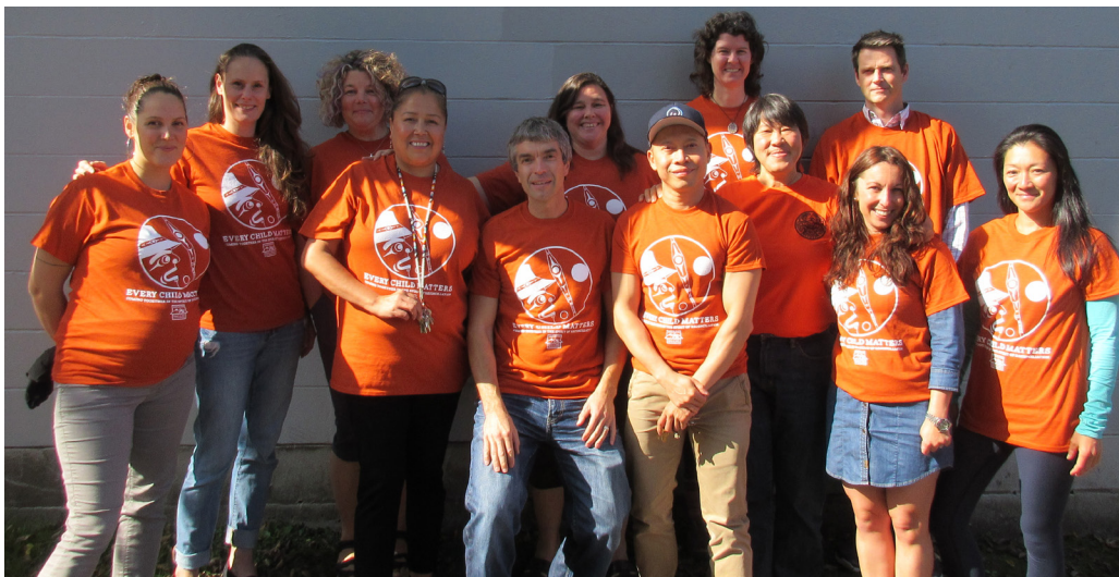
Britannia Staff Orange Shirt Day 2016