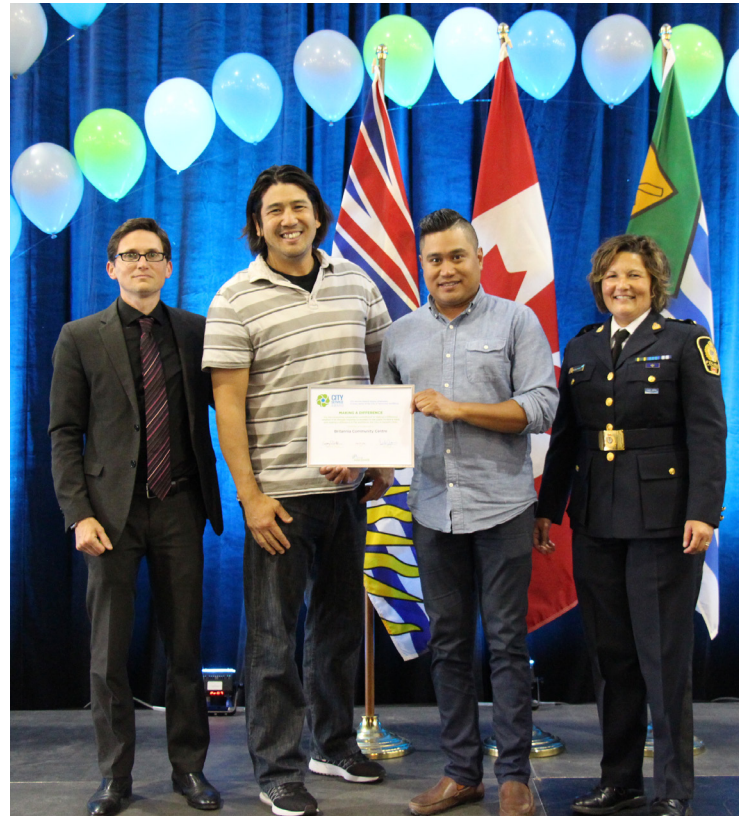
Britannia Staff Accepting 2016 City of Vancouver Service Award